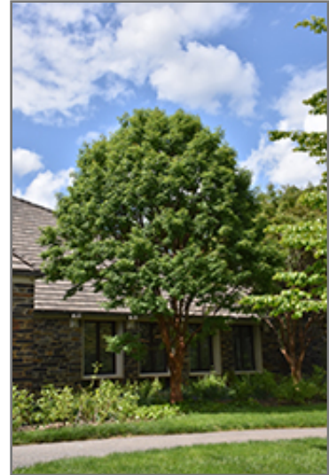
Paperbark Maple