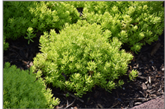
Lemon Coral Stonecrop