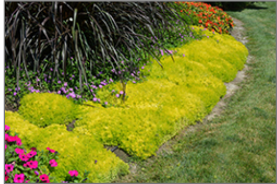
Lemon Coral Stonecrop

Lemon Coral Stonecrop will grow to be about 8 inches tall at maturity, with a spread of 12 inches. When grown in masses or used as a bedding plant, individual plants should be spaced approximately 10 inches apart. Its foliage tends to remain low and dense right to the ground. It grows at a fast rate, and under ideal conditions can be expected to live for approximately 10 years. As an herbaceous perennial, this plant will usually die back to the crown each winter, and will regrow from the base each spring. Be careful not to disturb the crown in late winter when it may not be readily seen!