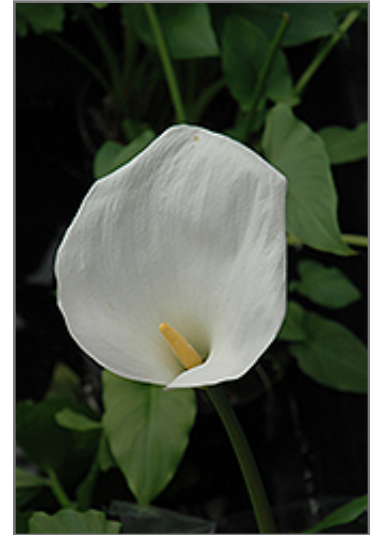
Calla Lily flowers