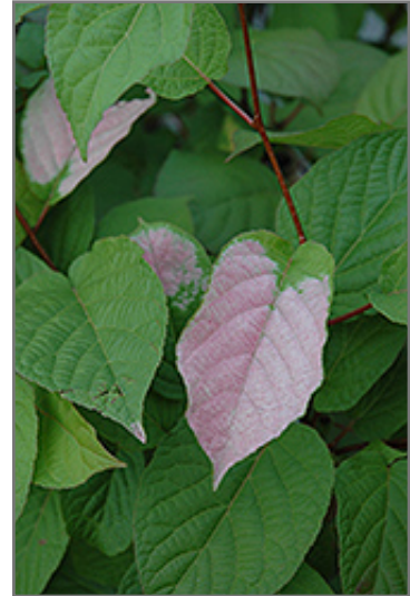
September Sun Kiwi foliage

September Sun Kiwi is recommended for the following landscape applications;