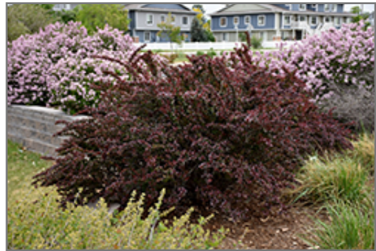
Red Leaf Japanese Barberry

Red Leaf Japanese Barberry is recommended for the following landscape applications;