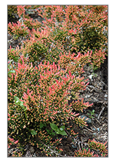
Red Fred Heather in bloom