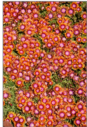
Fire Spinner Ice Plant flowers