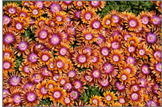
Fire Spinner Ice Plant in bloom

Fire Spinner Ice Plant is recommended for the following landscape applications;