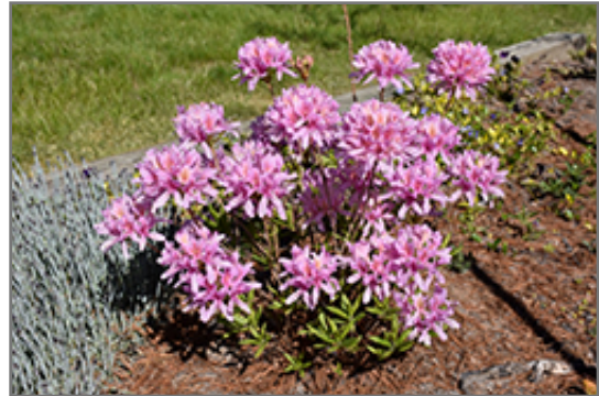
Orchid Lights Azalea in bloom