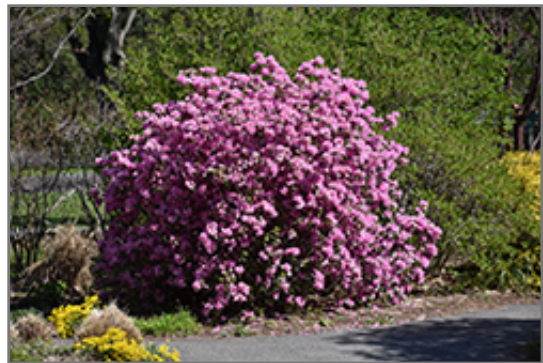
P.J.M. Elite Rhododendron in bloom