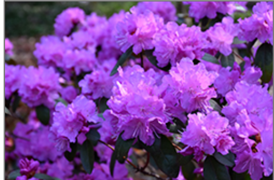
P.J.M. Elite Rhododendron flowers