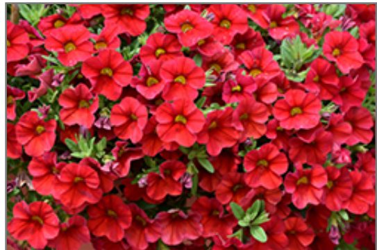
Superbells Red Calibrachoa flowers

Superbells Red Calibrachoa is recommended for the following landscape applications;