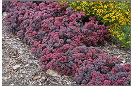
Dazzleberry Stonecrop in bloom