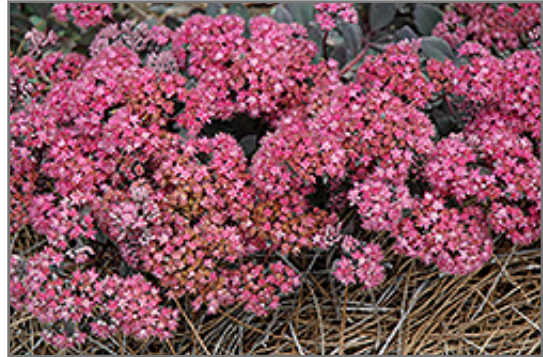
Dazzleberry Stonecrop flowers

Dazzleberry Stonecrop is a dense herbaceous perennial with an upright spreading habit of growth. Its medium texture blends into the garden, but can always be balanced by a couple of finer or coarser plants for an effective composition.