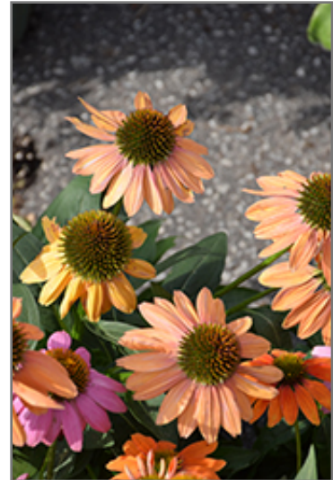
Cheyenne Spirit Coneflower flowers