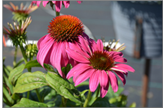
Cheyenne Spirit Coneflower flowers

Cheyenne Spirit Coneflower will grow to be about 16 inches tall at maturity extending to 24 inches tall with the flowers, with a spread of 18 inches. Its foliage tends to remain dense right to the ground, not requiring facer plants in front. It grows at a medium rate, and under ideal conditions can be expected to live for approximately 10 years. As an herbaceous perennial, this plant will usually die back to the crown each winter, and will regrow from the base each spring. Be careful not to disturb the crown in late winter when it may not be readily seen!