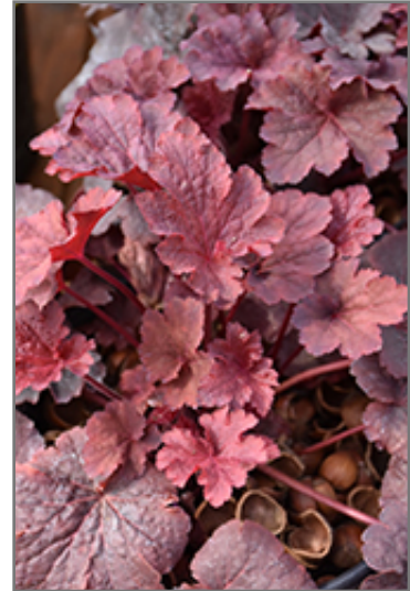
Cajun Fire Coral Bells foliage

Cajun Fire Coral Bells is recommended for the following landscape applications;