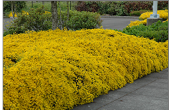
Lydia Woadwaxen in bloom