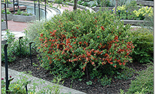
Japanese Flowering Quince in bloom

10060 Hwy I, Wolfville, NS B4P 2R2 902-542-3346 blomidonnurseries.com