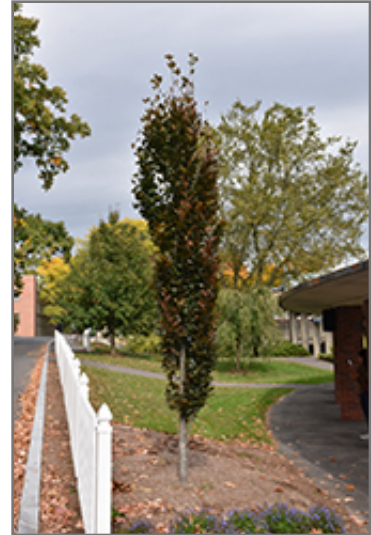
Dawyck Purple Beech