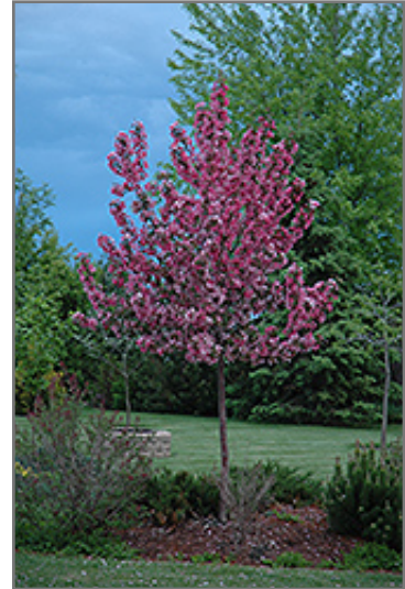
Rudolph Flowering Crab in bloom

Rudolph Flowering Crab is recommended for the following landscape applications;