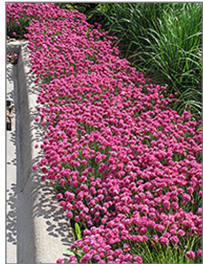
Dusseldorf Pride Sea Thrift in bloom

Dusseldorf Pride Sea Thrift is recommended for the following landscape applications;