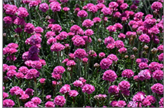
Dusseldorf Pride Sea Thrift flowers

Dusseldorf Pride Sea Thrift will grow to be only 6 inches tall at maturity extending to 8 inches tall with the flowers, with a spread of 8 inches. Its foliage tends to remain low and dense right to the ground. It grows at a slow rate, and under ideal conditions can be expected to live for approximately 10 years. As an evergreen perennial, this plant will typically keep its form and foliage year-round.