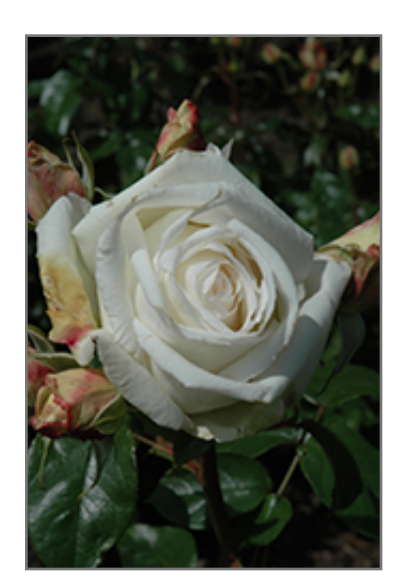
Full Sail Rose flowers