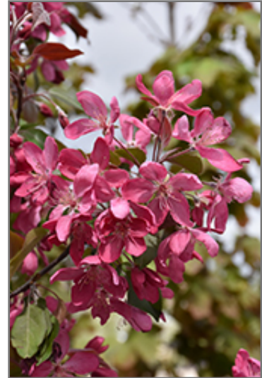
Royal Mist Flowering Crab flowers