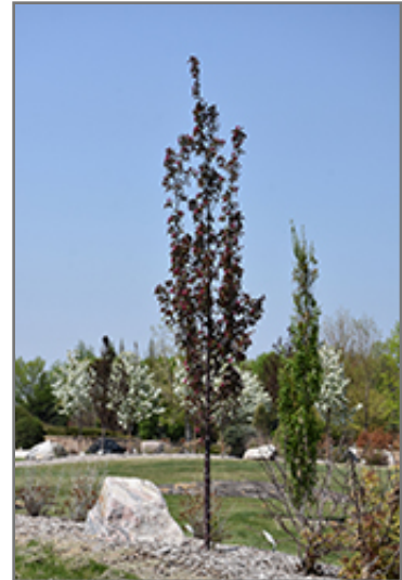
Royal Mist Flowering Crab in bloom