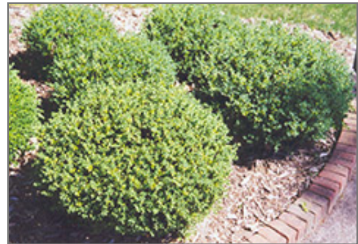
Japanese Boxwood