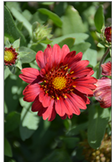
Mesa Red Blanket Flower flowers

Mesa Red Blanket Flower is recommended for the following landscape applications;