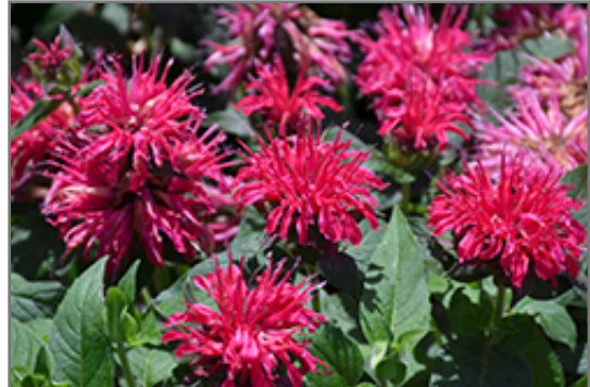
Balmy Rose Beebalm flowers