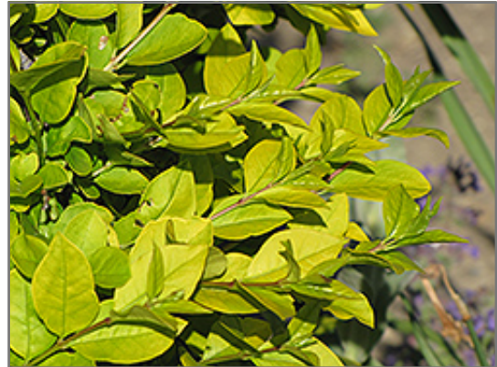
Golden Privet foliage