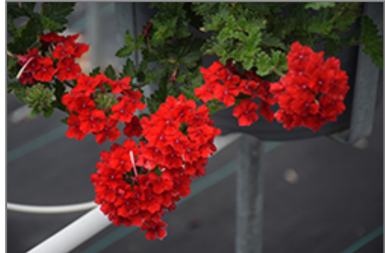
Superbena Royale Red Verbena flowers

Superbena Royale Red Verbena is recommended for the following landscape applications;