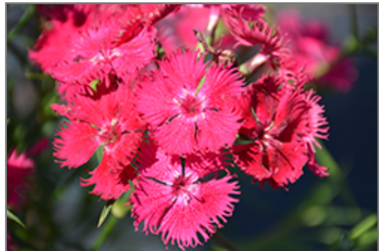
Rockin' Rose Pinks flowers

Rockin' Rose Pinks is recommended for the following landscape applications;