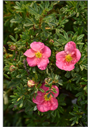
Bella Bellissima Potentilla flowers