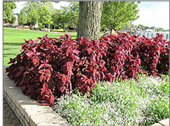
ColorBlaze Rediculous Coleus