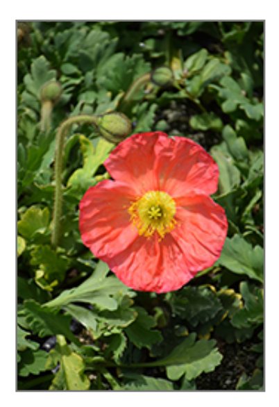
Champagne Bubbles Pink Poppy flowers