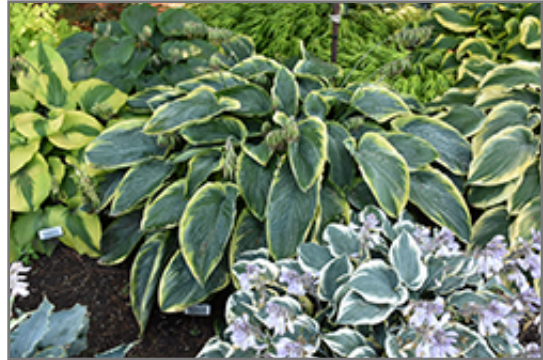
Shadowland Wu-La-La Hosta