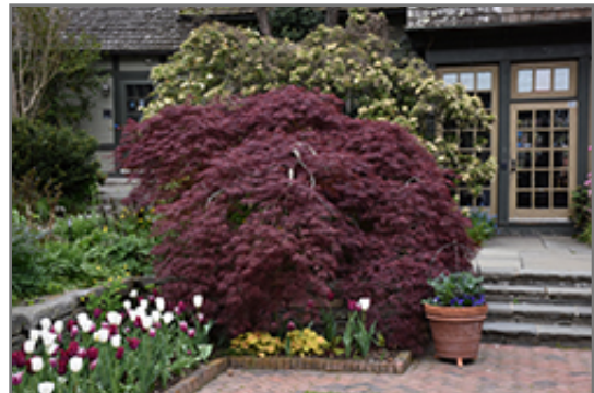
Tamukeyama Japanese Maple

Tamukeyama Japanese Maple is recommended for the following landscape applications;