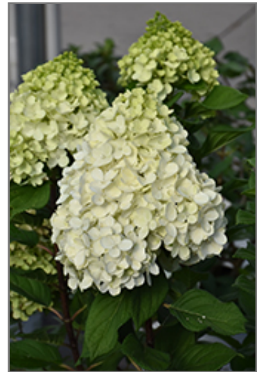
Little Lime Punch Hydrangea flowers