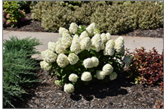
Little Lime Punch Hydrangea in bloom

Little Lime Punch Hydrangea makes a fine choice for the outdoor landscape, but it is also well-suited for use in outdoor pots and containers. With its upright habit of growth, it is best suited for use as a 'thriller' in the 'spiller-thriller-filler' container combination; plant it near the center of the pot, surrounded by smaller plants and those that spill over the edges. It is even sizeable enough that it can be grown alone in a suitable container. Note that when grown in a container, it may not perform exactly as indicated on the tag - this is to be expected. Also note that when growing plants in outdoor containers and baskets, they may require more frequent waterings than they would in the yard or garden.