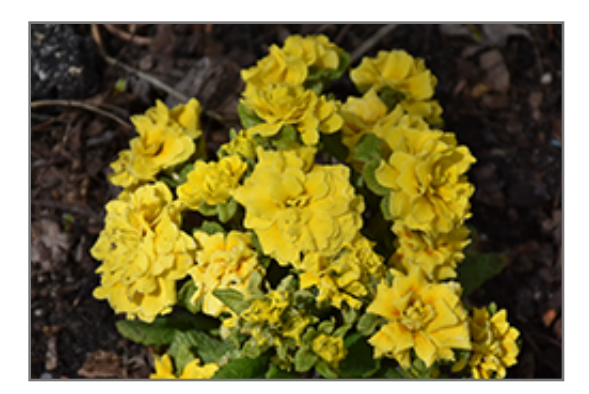
Prima Belarina Spring Sun Primrose in bloom