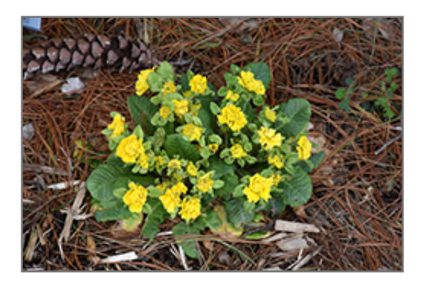
Prima Belarina Spring Sun Primrose in bloom

10060 Hwy I, Wolfville, NS B4P 2R2 902-542-3346 blomidonnurseries.com