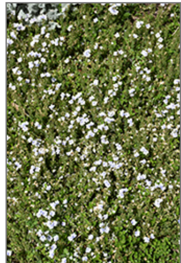
Snowmass Blue-Eyed Veronica in bloom