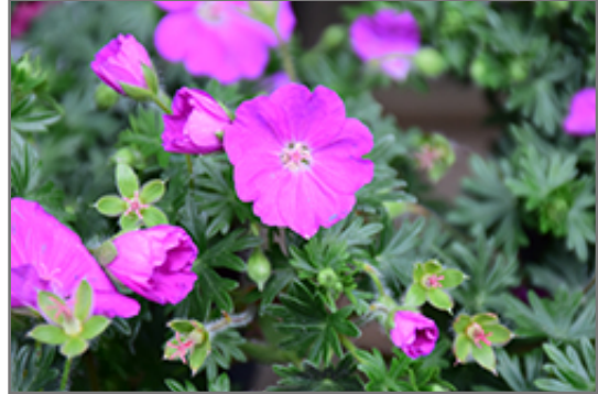
Max Frei Cranesbill flowers

Max Frei Cranesbill will grow to be about 8 inches tall at maturity, with a spread of 12 inches. When grown in masses or used as a bedding plant, individual plants should be spaced approximately 10 inches apart. Its foliage tends to remain low and dense right to the ground. It grows at a medium rate, and under ideal conditions can be expected to live for approximately 10 years. As an herbaceous perennial, this plant will usually die back to the crown each winter, and will regrow from the base each spring. Be careful not to disturb the crown in late winter when it may not be readily seen!