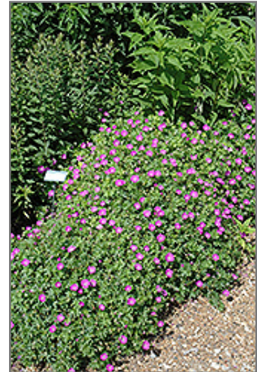
Max Frei Cranesbill in bloom