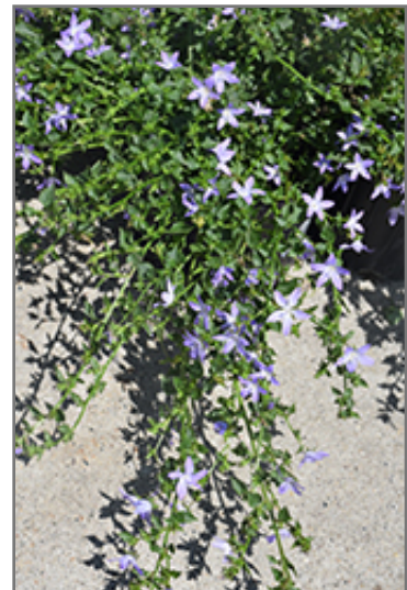
Blue Waterfall Serbian Bellflower in bloom