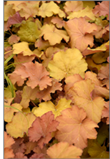
Caramel Coral Bells foliage

Caramel Coral Bells is recommended for the following landscape applications;