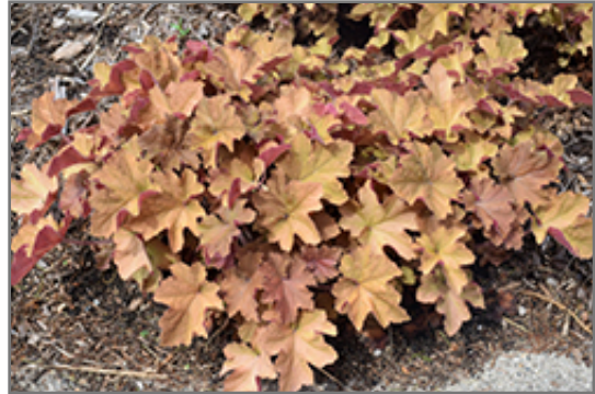
Caramel Coral Bells

Caramel Coral Bells will grow to be about 10 inches tall at maturity extending to 18 inches tall with the flowers, with a spread of 18 inches. When grown in masses or used as a bedding plant, individual plants should be spaced approximately 15 inches apart. Its foliage tends to remain low and dense right to the ground. It grows at a medium rate, and under ideal conditions can be expected to live for approximately 10 years. As an evergreen perennial, this plant will typically keep its form and foliage year-round.