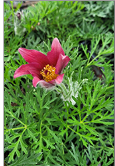
Red Pasqueflower flowers