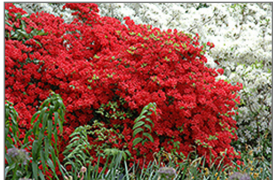
Stewartsonian Azalea in bloom