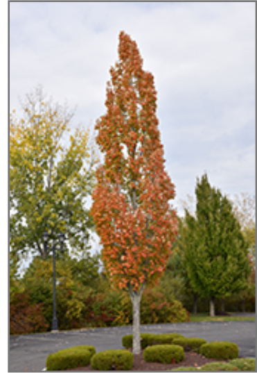
Armstrong Maple in fall

This tree should only be grown in full sunlight. It is quite adaptable, preferring to grow in average to wet conditions, and will even tolerate some standing water. It is not particular as to soil type or pH. It is highly tolerant of urban pollution and will even thrive in inner city environments. This particular variety is an interspecific hybrid.