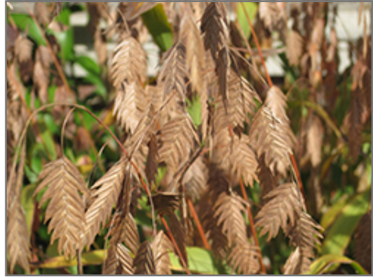
Northern Sea Oats fruit

Northern Sea Oats will grow to be about 4 feet tall at maturity, with a spread of 30 inches. Its foliage tends to remain dense right to the ground, not requiring facer plants in front. It grows at a medium rate, and under ideal conditions can be expected to live for approximately 10 years. As an herbaceous perennial, this plant will usually die back to the crown each winter, and will regrow from the base each spring. Be careful not to disturb the crown in late winter when it may not be readily seen!