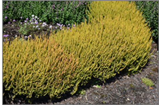
Firefly Heather

This shrub should only be grown in full sunlight. It requires an evenly moist well-drained soil for optimal growth, but will die in standing water. It is very fussy about its soil conditions and must have sandy, acidic soils to ensure success, and is subject to chlorosis (yellowing) of the foliage in alkaline soils. It is somewhat tolerant of urban pollution, and will benefit from being planted in a relatively sheltered location. Consider applying a thick mulch around the root zone in winter to protect it in exposed locations or colder microclimates. This is a selected variety of a species not originally from North America.