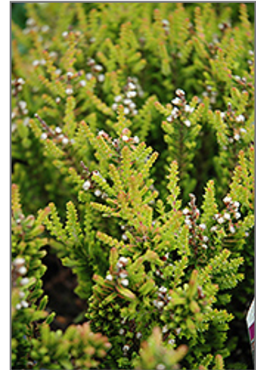
Firefly Heather foliage