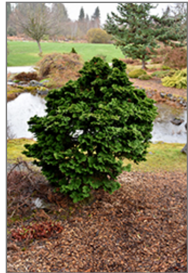
Dwarf Hinoki Falsecypress

Dwarf Hinoki Falsecypress will grow to be about 4 feet tall at maturity, with a spread of 4 feet. It tends to fill out right to the ground and therefore doesn't necessarily require facer plants in front. It grows at a medium rate, and under ideal conditions can be expected to live for 40 years or more.