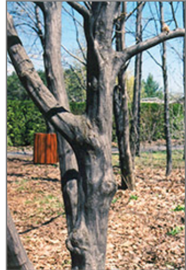
American Hornbeam bark

This tree performs well in both full sun and full shade. It is an amazingly adaptable plant, tolerating both dry conditions and even some standing water. It is not particular as to soil type or pH. It is somewhat tolerant of urban pollution. This species is native to parts of North America.