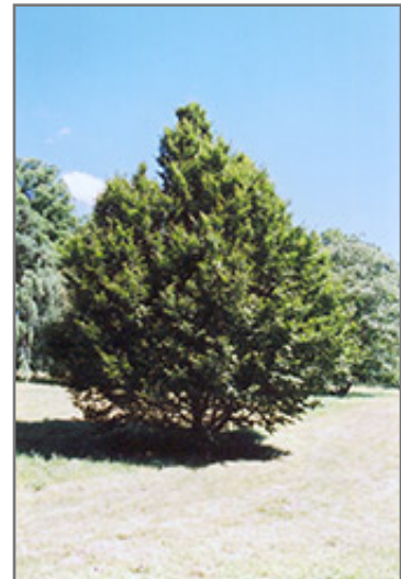
American Hornbeam