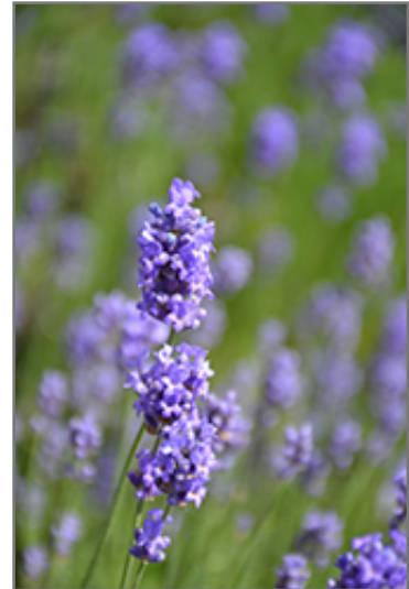
Hidcote Blue Lavender flowers