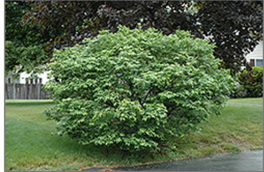
Compact Winged Burning Bush

Compact Winged Burning Bush will grow to be about 7 feet tall at maturity, with a spread of 7 feet. It tends to fill out right to the ground and therefore doesn't necessarily require facer plants in front, and is suitable for planting under power lines. It grows at a slow rate, and under ideal conditions can be expected to live for 50 years or more.