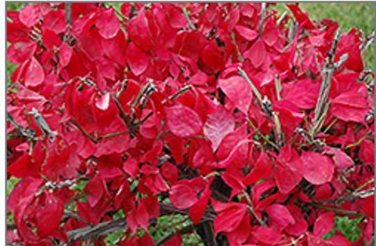
Compact Winged Burning Bush in fall