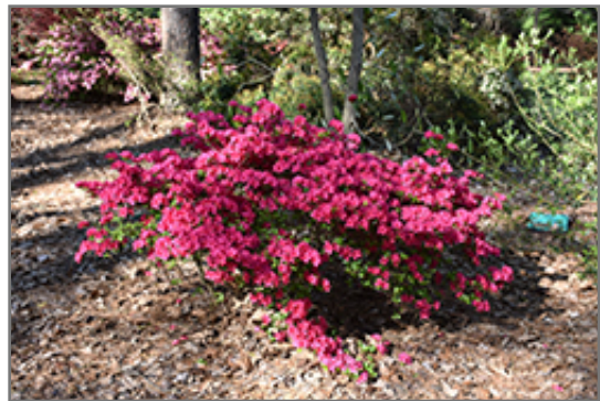
Girard's Fuchsia Evergreen Azalea in bloom