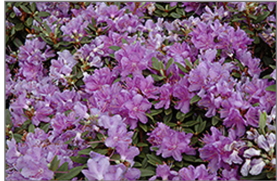
Purple Gem Rhododendron flowers