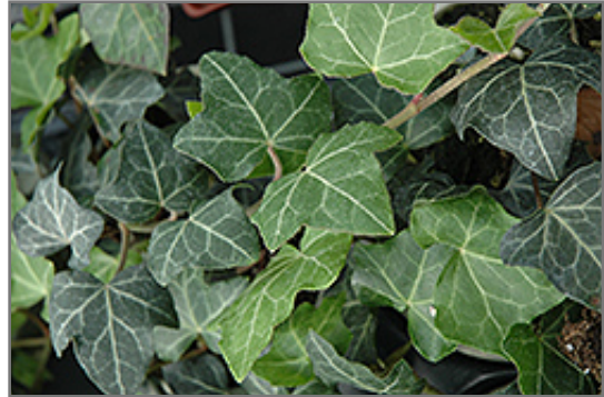
Baltic Ivy foliage