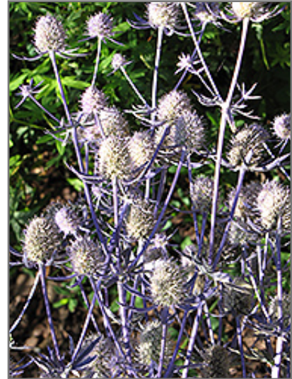
Jade Frost Variegated Sea Holly flowers

Jade Frost Variegated Sea Holly will grow to be about 8 inches tall at maturity extending to 24 inches tall with the flowers, with a spread of 15 inches. When grown in masses or used as a bedding plant, individual plants should be spaced approximately 12 inches apart. Its foliage tends to remain low and dense right to the ground. It grows at a medium rate, and under ideal conditions can be expected to live for approximately 10 years. As an herbaceous perennial, this plant will usually die back to the crown each winter, and will regrow from the base each spring. Be careful not to disturb the crown in late winter when it may not be readily seen!