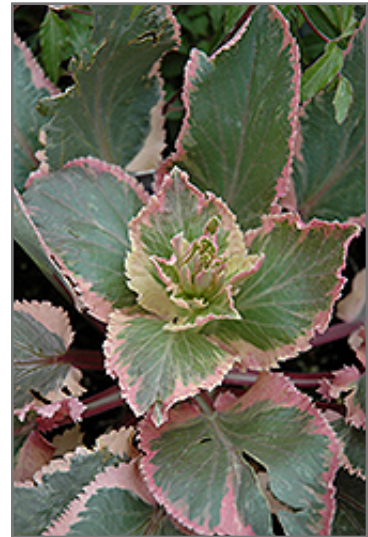
Jade Frost Variegated Sea Holly foliage